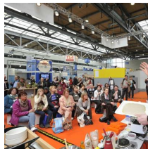
Fachausstellungen Heckmann GmbH