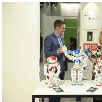
Fachausstellungen Heckmann GmbH