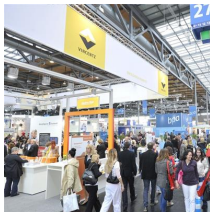
Fachausstellungen Heckmann GmbH

Messegelände 30521 Hannover Germany Europe