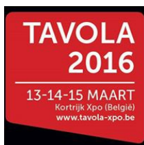
Tavola Internationale Fachmesse für frische Nahrungsmittel und Delikatessen